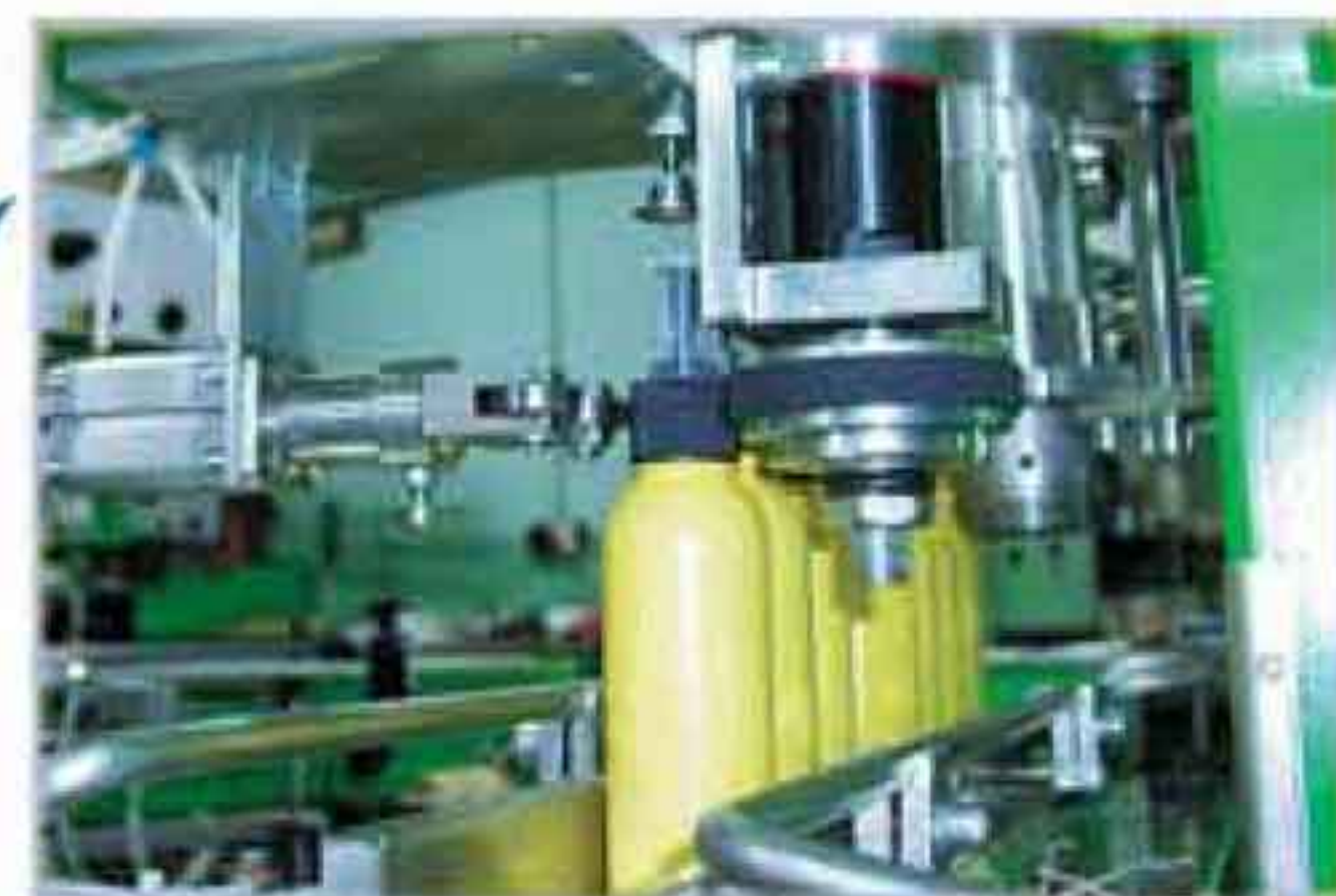
Automatic spinning with the help of lateral rollers.